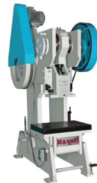
'C' Frame Inclinable Type