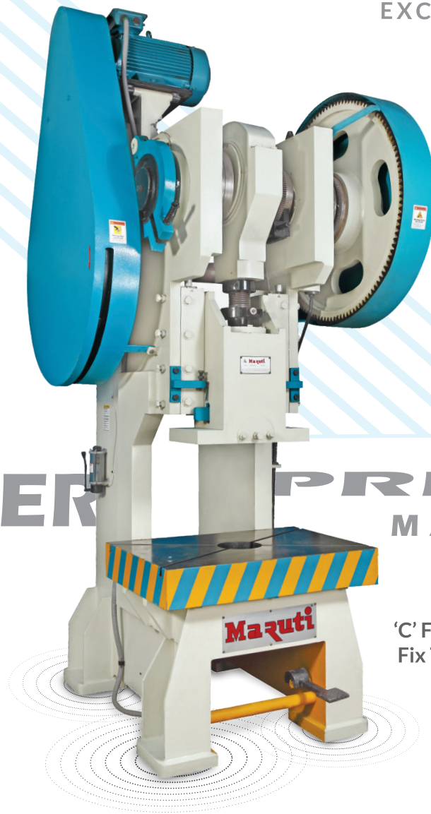
'C' Frame Fix Type